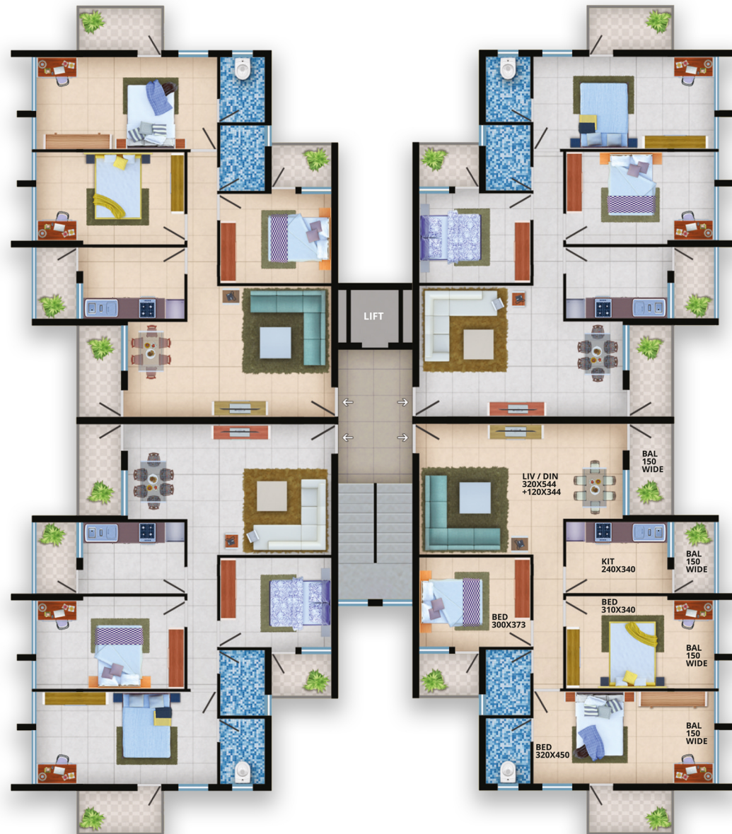
TYPICAL FLOOR PLAN FOR UPPER GROUND, FIRST, SECOND AND THIRD FLOOR